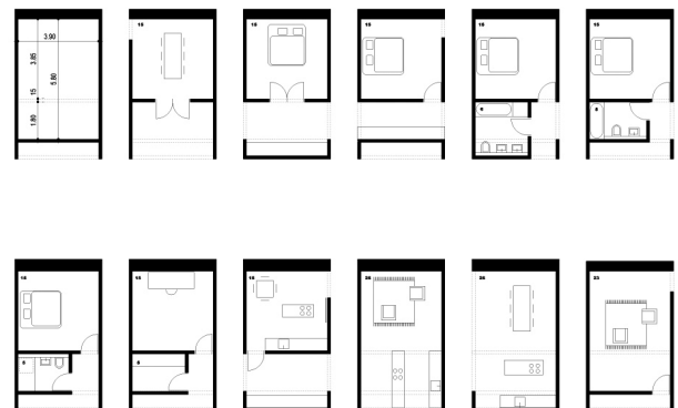
Fig 2: Functional module measuring 22m 2 adapting to the different functionalities of the accommodation

At the building level, the concept of Swisswoodhouse rests on the observation of potential for increasing population density at the core of the existing building and close to the nexus of public transport in suburban localities of built-up areas. This analysis has led to a reflection on the optimal size for such a building. The approach aims to provide an alternative to the peri-urban individual houses with a 3-4 storey high building, presenting a sufficient size to contribute to the densification process, whilst avoiding the danger of anonymity present in high-rise developments.