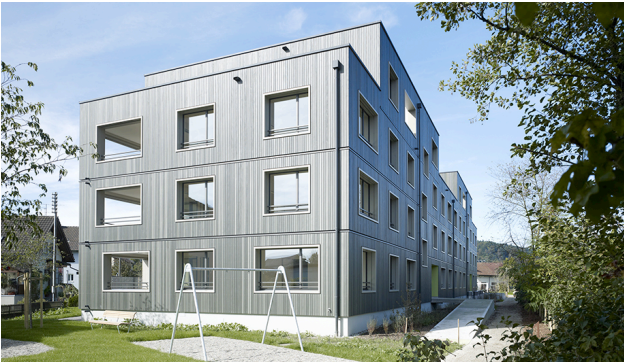
Fig 4: Exterior view of the pilot building

The aim was to densify a plot of land with very good public transport services, located near the railway station (about 5 minutes on foot), and near a river (Fig. 3-4). The chosen configuration for this pilot building is a 3-floor rental property with a loft and a total of 18 various types of dwellings (Table 1).