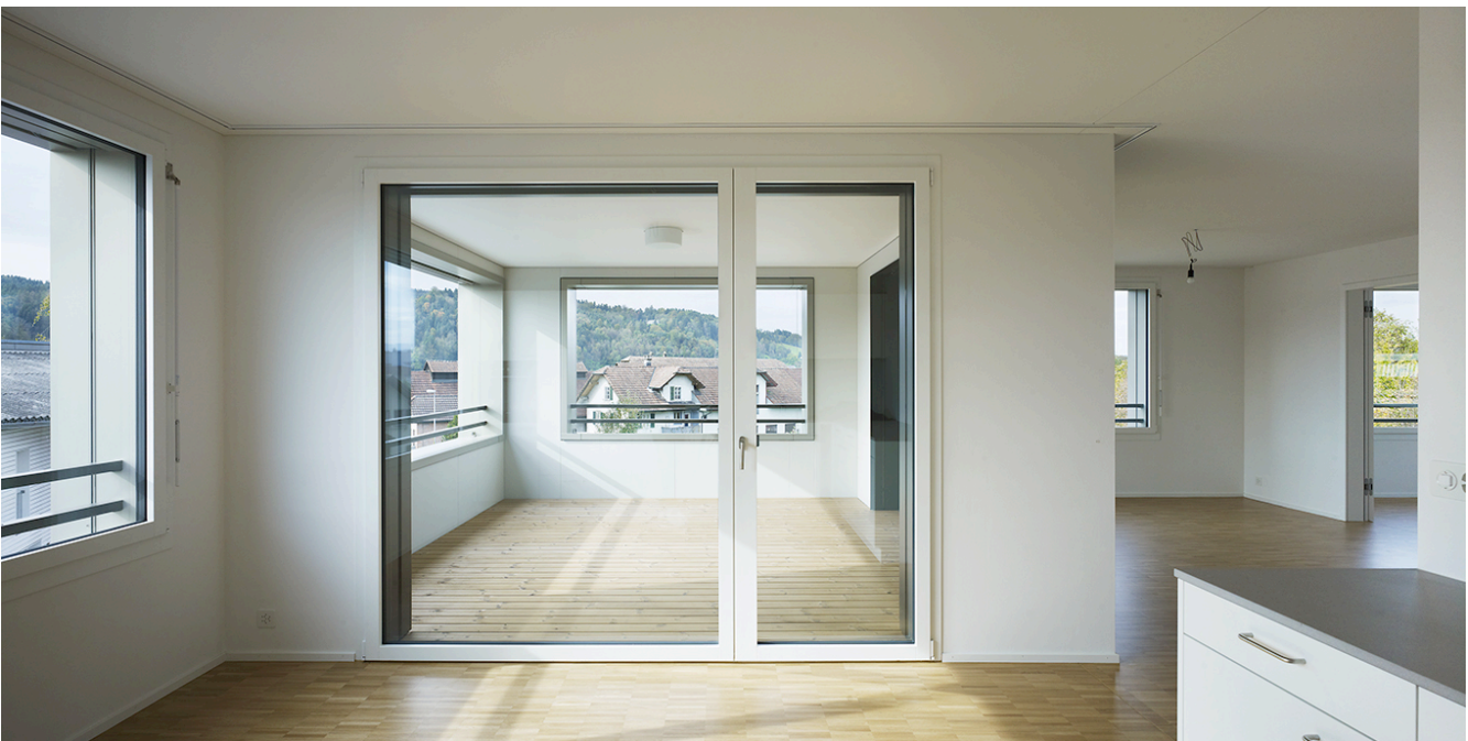
Fig 5: Interior view of a flat in the pilot building

With their different layouts, the 2.5- to 5.5-room dwellings reflect the multiple possibilities of the architectural concept. The apartments' key features of are their original spatial layout, the diversity of their visual interaction with the environment, their high flexibility of use and the quality of the exterior space arranged as loggias or terraces (fig. 5).