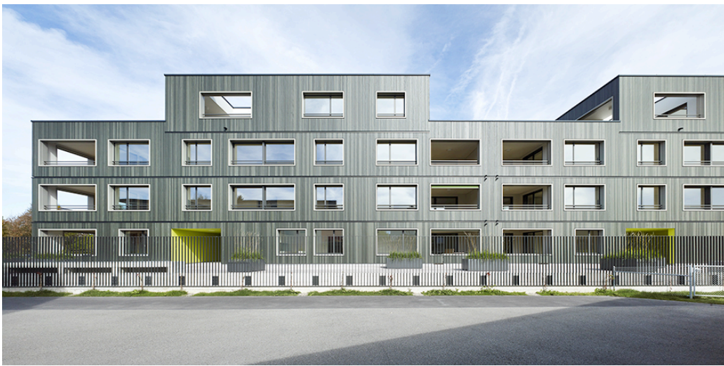
Fig 1: View of the pilot project built in Nebikon, Switzerland

2 Laboratory of Architecture and Sustainable Technologies (LAST), Ecole polytechnique fédérale de Lausanne (EPFL), Lausanne, Switzerland