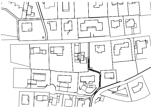
Situation | The house has its main volume in the south part of the plot