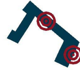
Diagram for the duality culture - health